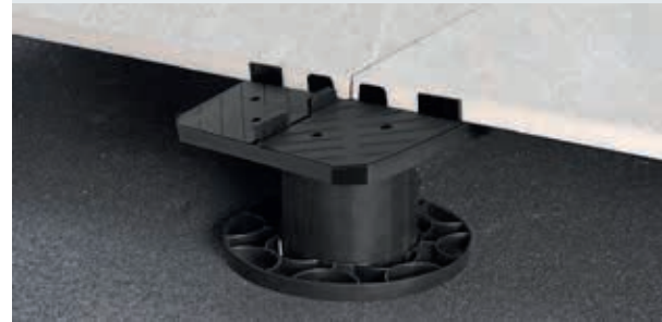
Raised using the DNS® system