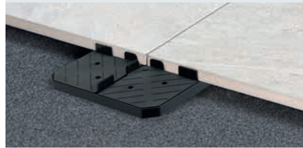
Slabs with fixplate lock on fixplate base