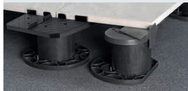
Support and edging with DNS® edge zone system