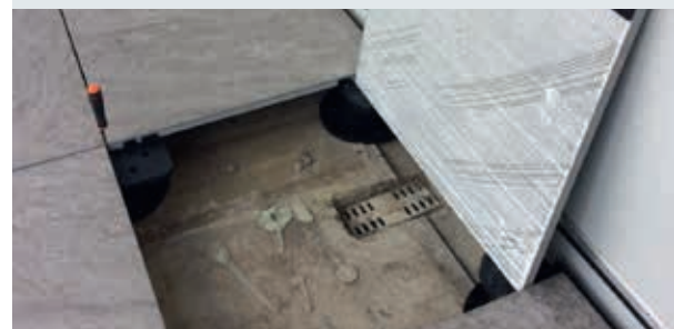
Underlying surface accessible following lock release