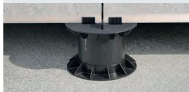
Raised using DNS®Large for ceramic slabs of 900x900 mm