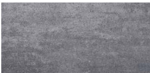
Nuance Light Grey*