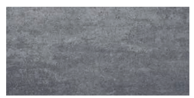
Nuance Light Grey*