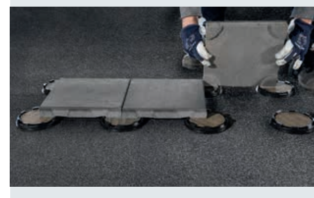
On a sloping roof, place the lockplate for Dreen®Nxt directly on the roof surface