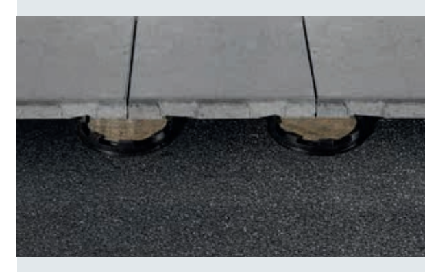
The slabs are fixed securely on the lockplates