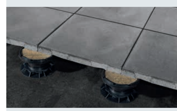
Dreen®Nxt can easily be raised and levelled by combining the lockplate with the DNS® system or the adjustable pedestal system