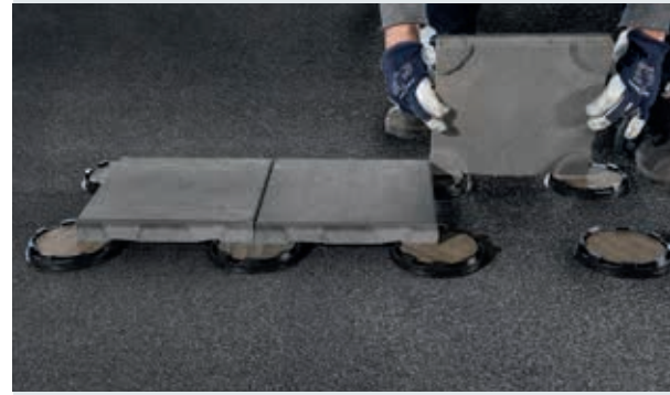
On a sloping roof, place the lockplate for Dreen®Nxt directly on the roof surface