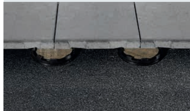
The slabs are fixed securely on the lockplates