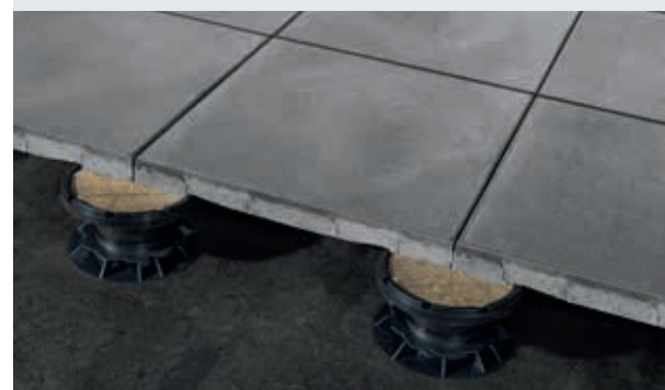
Dreen®Nxt can easily be raised and levelled by combining the lockplate with the DNS® system or the adjustable pedestal system