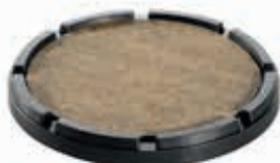
Lockplate slab >300x300 mm