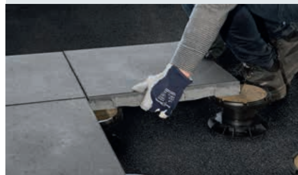
Dreen®Nxt features a recess on the base of the slab that fits precisely into the lockplate